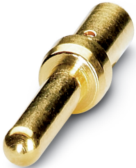
Crimp contact, turned, contact diameter: 2 mm, crimp range: 1 mm 2 ... 1.5 mm 2

Please be informed that the data shown in this PDF Document is generated from our Online Catalog. Please find the complete data in the user's documentation. Our General Terms of Use for Downloads are valid ( http://phoenixcontact.com/download )